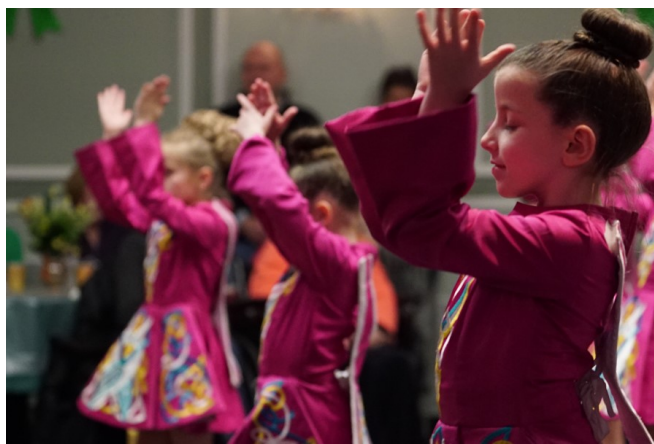
GREAT CRAIC ON A SUNDAY AFTERNOON!